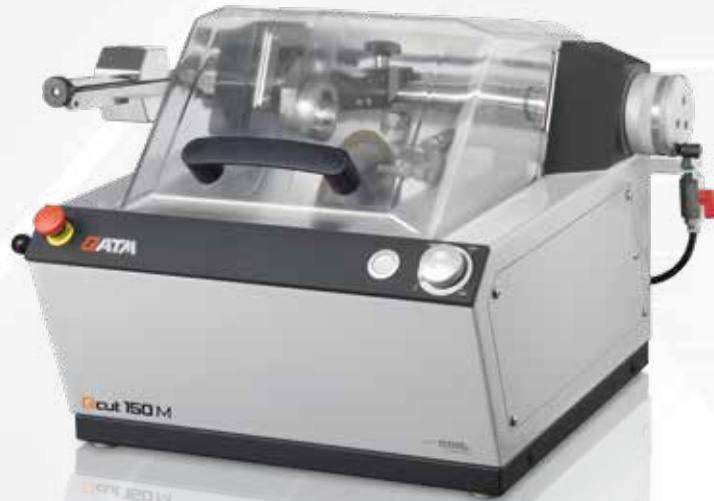
Qcut 150 M