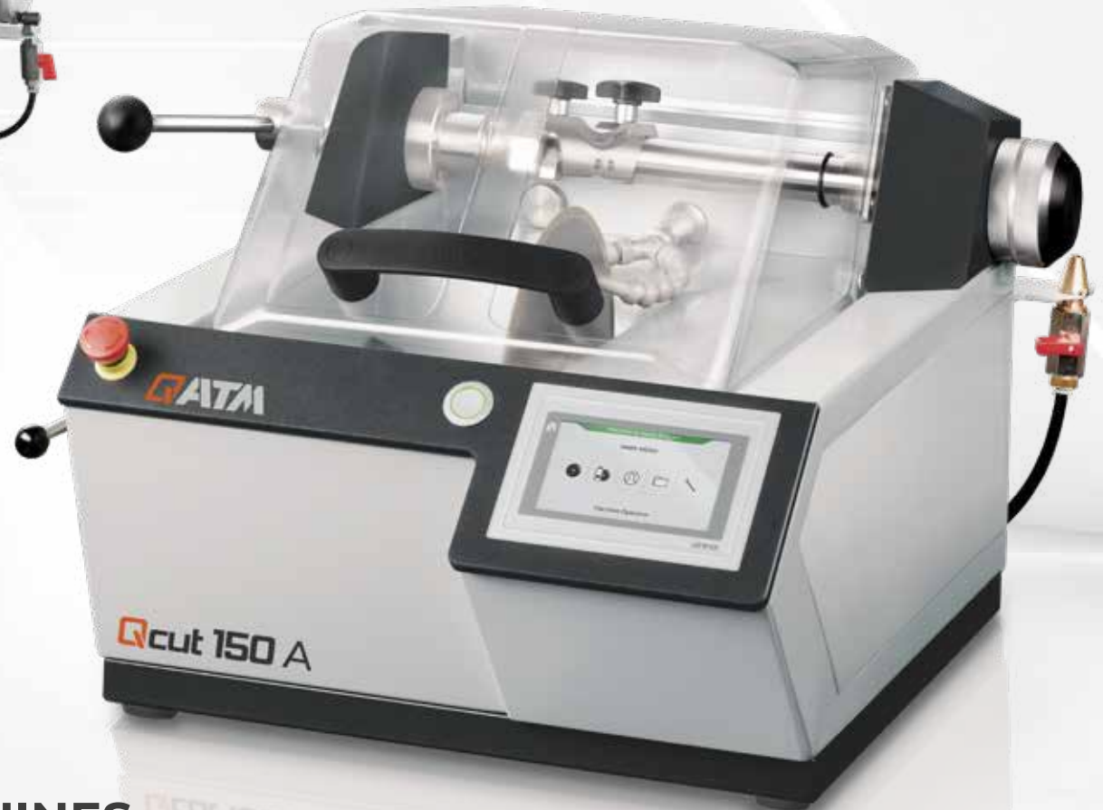
Qcut 150 A