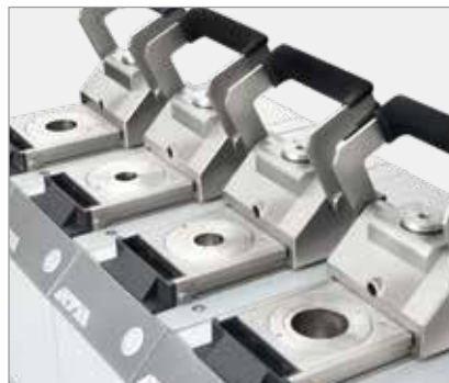
Modularity in diameter size and units