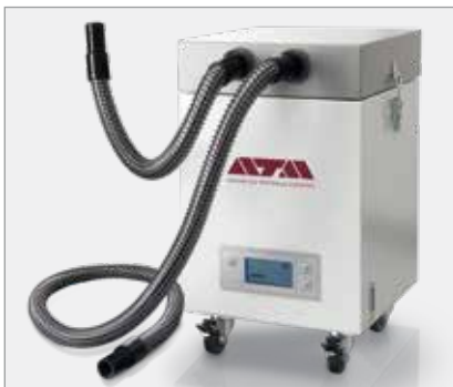
Vacuum cleaner – the heart of the Dust Guard