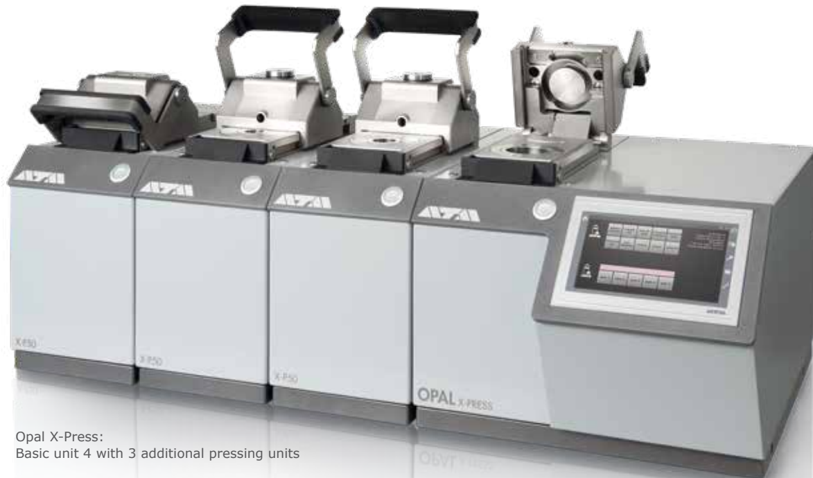
Opal X-Press: Basic unit 4 with 3 additional pressing units

The hot mounting press Opal X-Press was developed for fast, simultaneous mounting of several materialographic specimens which may differ in size and material. The modular design allows for individual configuration of each mounting process.