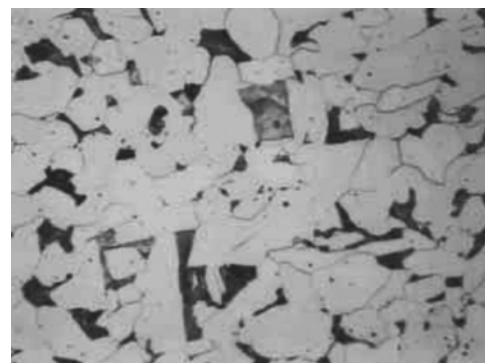
CFC finished with 0.3um Alumina on Planocloth 0.1% C steel finished with 0.05um alumina on alphascloth.

MetPrep Technical Bulletin 0048 - 2016. For further information please contact sales@metprep.co.uk