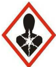
GHS08 health hazard

Flam. Liq. 2 H225 Highly flammable liquid and vapour.