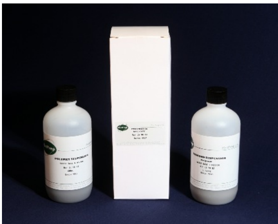
Polymet special formula diamond suspension