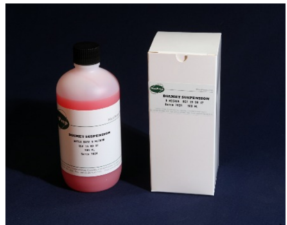
Diamet self lubricating diamond suspension

MetPrep Technical Bulletin 0020 - 2015. For further information please contact sales@metprep.co.uk