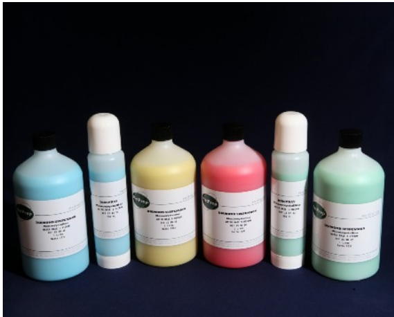
Monocrystalline Diamond Suspensions