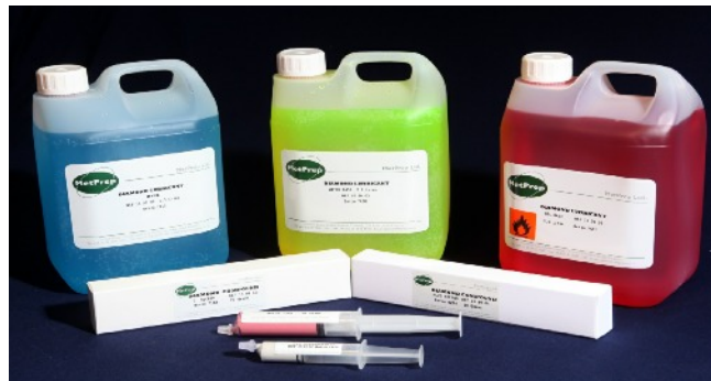
Monocrystalline & Polycrystalline paste + Alcohol based - Water Based & Oil based lubricants