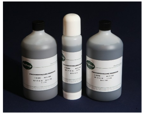
Polycrystalline Diamond Suspensions